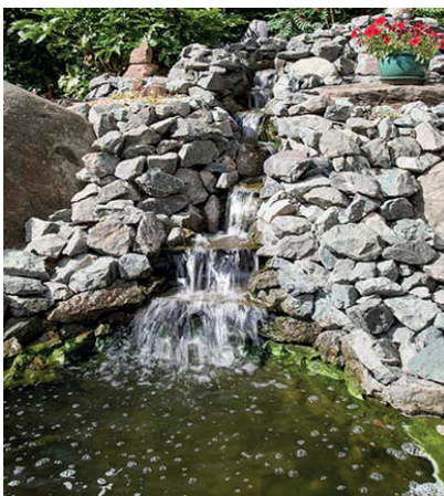
Example use: Pond linings