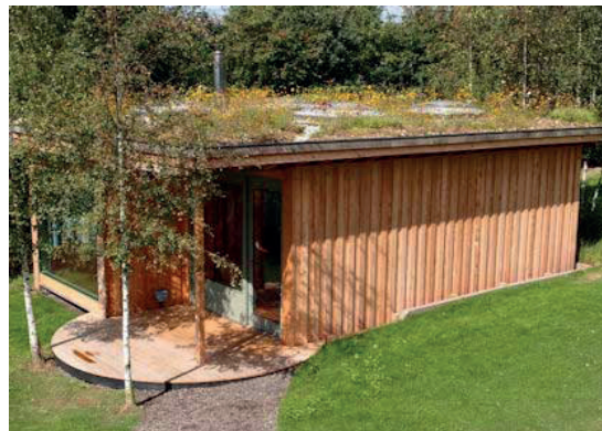
Example use: Waterproof green roof linings