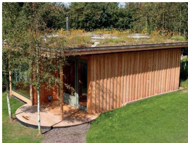
Example use: Waterproof green roof linings