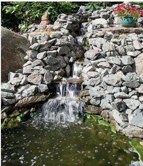
Example use: Pond linings