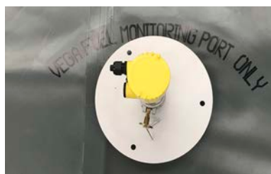
VEGA Fuel Monitoring System Stabilising Plate