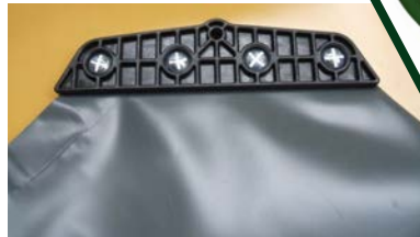
Reinforced corner mouldings and integral tie down holes