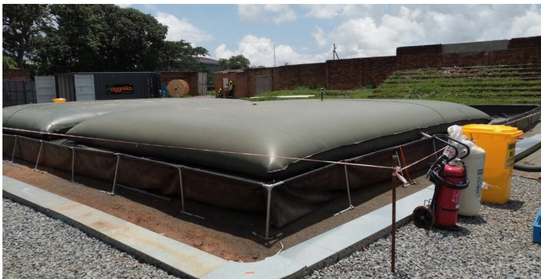
Above: 2 x 100m 3 Bladder / Berm system installed Malawi, 2018; Image courtesy Aggreko Rental Power Services

** Please refer to our Chemical resistance charts when considering suitability of these bladders for specific fuels / chemicals