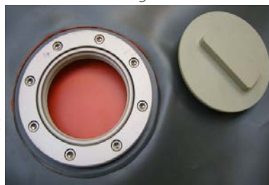
2" BSP outlet and plug